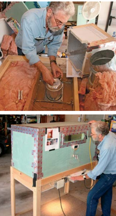
The author tested seven different bulbs in five air-sealing enclosures.

The highest temperatures recorded approached 250°F with a standard incandescent bulb. Although this isn't the bulb that these fixtures are designed for, weatherization crews routinely find them in can lights. Even with the correct bulb, though, temperatures inside the boxes routinely exceeded 160°F, high enough to degrade the insulation on older versions of nonmetallic-sheathed (NM) cable, which