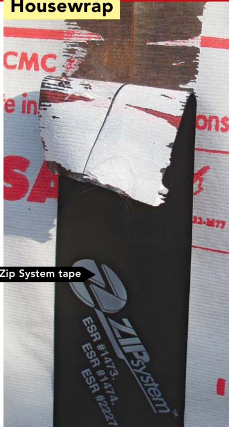
Zip System tape

Most brands of housewrap are easy to tape; I used Typar for my test. Three tapes tied for first place: 3M All Weather Flashing Tape, Zip System tape, and Siga Sicrall . The next-best tapes were the two housewrap tapes from Venture (Venture 1585CW-P2 and Venture 1585HT/W), which performed about the same. These two tapes cost so much less than the best-performing tapes that they are probably the tapes to choose. The worst-performing tape was Dow Weathermate.