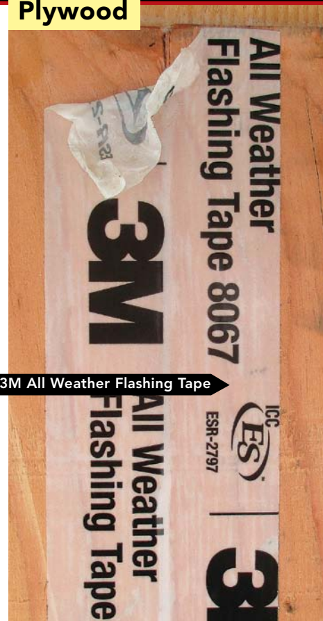
3M All Weather Flashing Tape

Plywood is always easier to tape than OSB; I used CDX plywood for the test. Three tapes tied for first place: 3M All Weather Flashing Tape , Siga Wigluv , and Siga Sicrall . Pro Clima Tescon No. 1 adhered well, but the tape itself is weak and ripped when it was removed. Zip System tape adhered well and was a credible runner-up. In descending order, the losers were Polyken Shadowlastic, Venture 1585CW-P2, and Dow Weathermate.