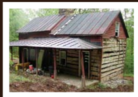
The original toll keeper's cabin