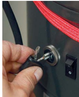
Connect the vacuum.