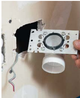
Start at the mounting plate.