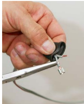
Attach friction terminals.