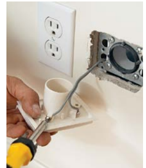
Connect the ports.

It's best to run the low-voltage wire at the same time as the pipe. Leave extra length at the port location, and run each wire back toward the vacuum unit so that it can be connected with wire nuts at a common junction of fittings. The circuit is a simple loop, so polarity isn't important. Use electrician's tape to keep the wires neat. At the vacuum, crimp friction terminals onto the leads, and plug them into the vacuum. At the port, strip back about 1/2 in. of the wire's insulation, wrap each lead clockwise around its terminal, and tighten the screw. Finally, screw the port onto the mounting plate.