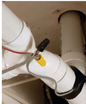
Make junctions at PVC joints.