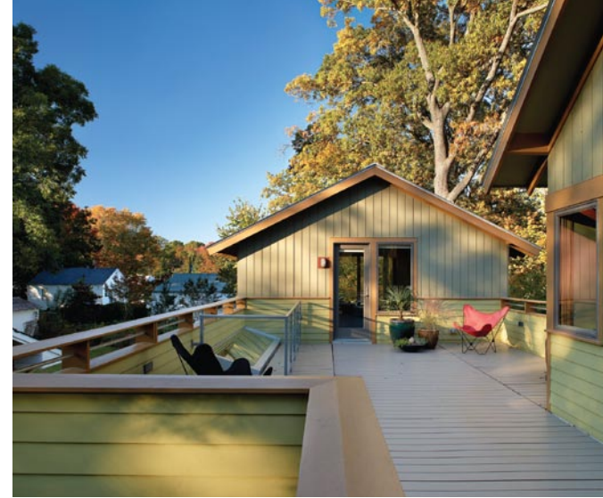
Replace the roof with an outdoor living room. Set under a canopy of trees, the rooftop deck is a courtyard between the guest house and the master bedroom. The space is suitable for entertaining or as a private retreat from the busy life below. Photo taken at G on floor plan.

The Martins' house is an example of how a new home can fit in an older neighborhood if the design is sensitive to the site. Instead of trying to create a stark contrast between indoor and outdoor spaces—and feeling the pressure to shoehorn a house onto a tight urban lot—the author and the homeowners embraced the site constraints and designed the home so that interior and exterior spaces would blend together. You climb up through the house, as you do the site, moving through indoor and outdoor spaces effortlessly.