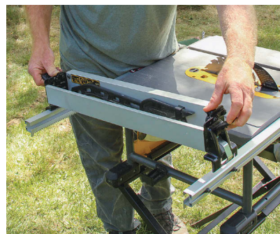
Table size 19 in. by 19 in. Weight 45 lb. Blade diameter 8¼ in. Rip capacity 12½ in. left, 34¾ in. right Maximum depth of cut 2⅞ in. at 90°, 1¾ in. at 45° Price $550 (tool only)

SMART RIP FENCE The rip fence works well and functions the same as Milwaukee's. The fence attaches to geared rails on both ends, which makes it durable and accurate.