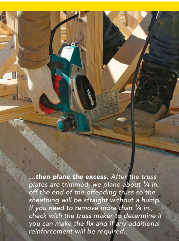
...then plane the excess. After the truss plates are trimmed, we plane about 1/4 in. off the end of the offending truss so the sheathing will be straight without a hump. If you need to remove more than 1/4 in., check with the truss maker to determine if you can make the fix and if any additional reinforcement will be required.