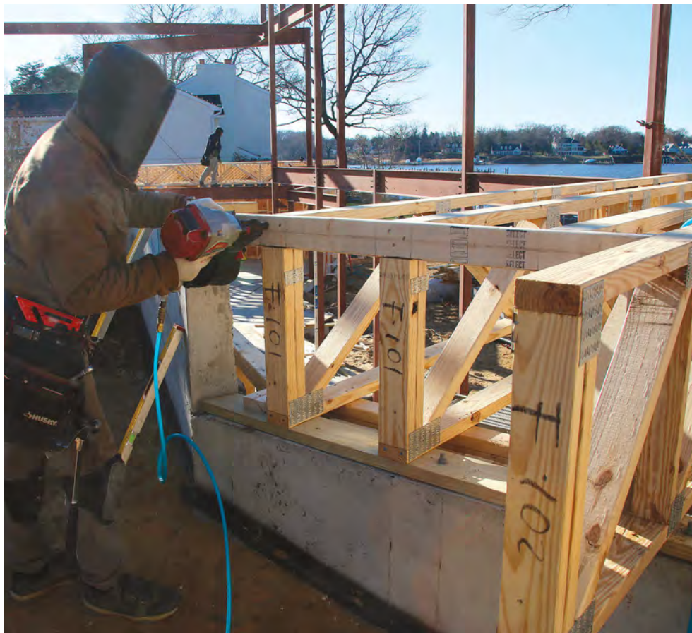
Connect the top chords. These trusses, which are flush with the foundation wall, have a 2x4 band to help plumb the trusses and strengthen the assembly. We transfer the truss layout to the band before installing it, and follow the component manufacturer's instructions for fastening.