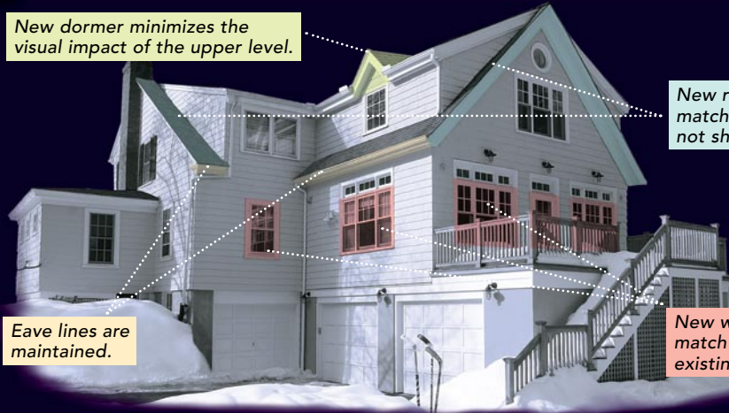
New windows match height of existing windows.

The first addition was retooled with one that preserves the steeper roof profile of the original house (photo below). Eave lines are maintained on both levels, which keeps this three-story structure from becoming overpowering. The uppermost level is treated as a dormer, minimizing its visual impact. The ceiling of the new addition is taller than elsewhere in the house. Transom windows take advantage of the additional height, while double-hung windows directly below the transoms maintain the head height and muntin configuration of the windows in the rest of the house.