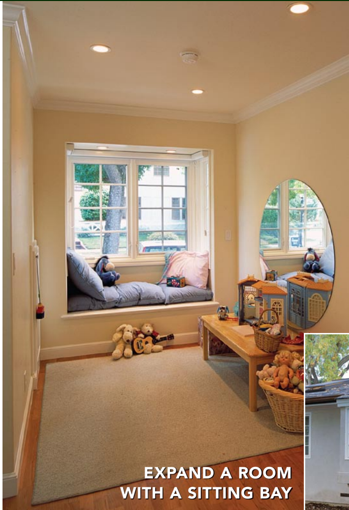
EXPAND A ROOM WITH A SITTING BAY

IN DENSELY POPULATED TOWNS, zoning laws can make it tough to add floor space to a house by bumping out a wall if it extends into the required setback from the lot lines. But in many of these same jurisdictions, bays that do not add floor area and that extend no more than 2 ft. beyond the exterior wall plane are exempted from square-footage calculations. Thus, sitting bays offer expansion possibilities for zoning-tight projects.