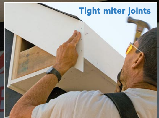
Tight miter joints

I leave the rake boards a bit long, hold them in position, and mark them for a more accurate cut. I keep this cut plumb (photo above left), even if the framing underneath isn't perfect. If the rake board isn't plumb, the miter won't come together correctly. The real key to miters that stay tight over the long haul is to allow for framing movement. To do this, I cut miters at 46°, fasten together the two halves of the miter joint (photo above right), and nail into the edges of the underlying soffit boards. I never nail directly into the framing on either side of the joint. This way, the corners can float as the framing moves.