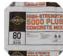
Sakrete High-Strength 5000 Plus Concrete Mix • 5000 psi

CRACK-RESISTANT MIXES contain fibers to increase tensile strength and reduce (but not eliminate) the need for steel reinforcement. Minimum thickness is 2 in.