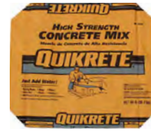
Quikrete High Strength Concrete Mix • 4000 psi

EVERYDAY CONCRETE MIXES are highly versatile and inexpensive, good for everything from slabs and footings to walkways and stairs. Minimum thickness is 2 in.