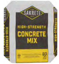
Sakrete High-Strength Concrete Mix • 4000 psi

HIGH-EARLY-STRENGTH MIXES are good for footings, but particularly useful for slabs that need to be placed in service quickly, and for cold-weather placement. Minimum thickness is 2 in.