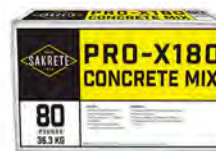
Sakrete Pro-X180 Concrete Mix • 6000 psi

AIR-ENTRAINING MIXES use an admixture to incorporate tiny air bubbles, increasing freeze-thaw resistance. Minimum thickness is 1½ in.