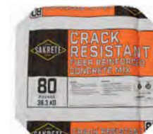
Sakrete Crack Resistant Fiber Reinforced Concrete Mix • 4000 psi