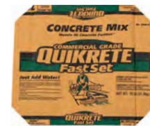
Quikrete FastSet Concrete Mix • 7000 psi (3000 psi in 3 hours)

work well for small patches in high-traffic areas. With a setting time of about half an hour, they aren't for larger pours. Minimum thickness is 1½ in.