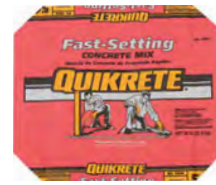
Quikrete Fast-Setting Concrete Mix • 4000 psi

FAST-SETTING MIXES are great for setting posts in the ground. There's no need to premix; just add water to the hole, followed by the concrete mix—or vice versa depending on instructions. Minimum thickness is 2 in.