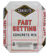
Sakrete Fast Setting Concrete Mix • 4000 psi