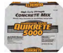
Quikrete 5000 High Early Strength Concrete Mix • 5000 psi

HIGH-EARLY-STRENGTH MIXES are good for footings, but particularly useful for slabs that need to be placed in service quickly, and for cold-weather placement. Minimum thickness is 2 in.