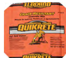
Quikrete Crack Resistant Concrete Mix • 4000 psi

CRACK-RESISTANT MIXES contain fibers to increase tensile strength and reduce (but not eliminate) the need for steel reinforcement. Minimum thickness is 2 in.