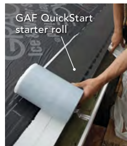
GAF QuickStart starter roll

Rake edges are similarly vulnerable to wind uplift, and some roofers like to run starter strips along the rake to help bond the shingles down. This helps, but the self-sealing strip on most starter shingles isn't very wide. As at the eaves, Fortified Home recommends bedding rake shingles in an 8-in.-wide band of roof cement to bond the top lap of each shingle to the roof's edge. In keeping with the spirit of the provision, I use a double-sided peel-and-stick sealing strip—Protecto Wrap's Roof Edge Seal. It installs like flashing tape but also has a release sheet covering the adhesive on the up-facing surface. You can bond the strip to the drip edge and underlayment, then remove the release sheet while installing the shingles.