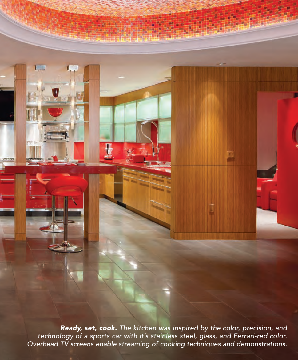
Ready, set, cook. The kitchen was inspired by the color, precision, and technology of a sports car with its stainless steel, glass, and Ferrari-red color. Overhead TV screens enable streaming of cooking techniques and demonstrations.