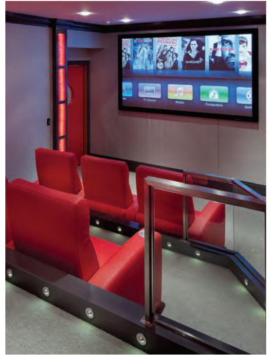
Pass the popcorn. The 17-ft. by 23-ft. home theater comfortably seats 10 in red-leather reclining chairs. The interior has fabric-wrapped sound-absorbing panels accented by LED-lit pilasters. The walls and ceiling are sound-proofed with mineral-wool insulation and additional layers of gypsum.