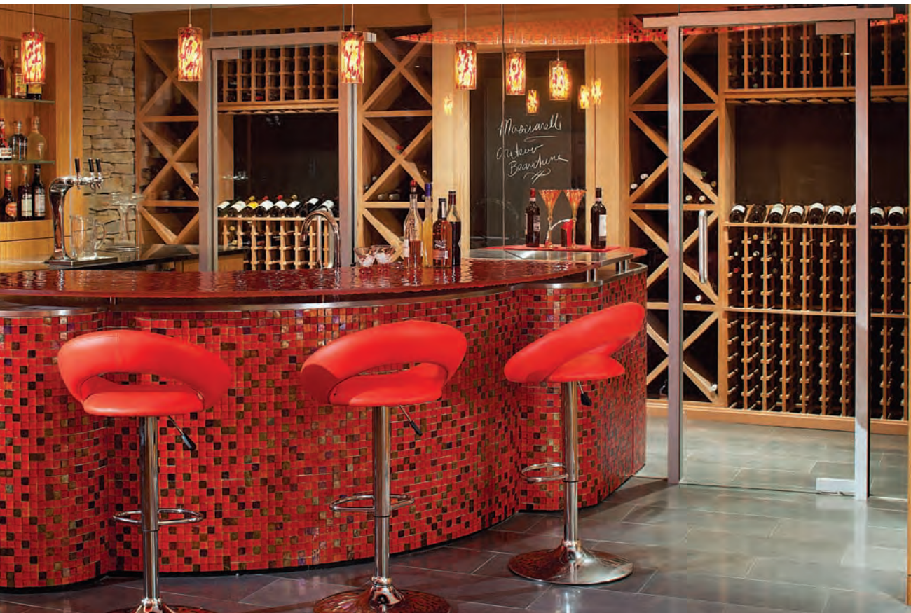
More than meets the eye. The bar and the 1,014-bottle wine-storage room are split by butt-glazed panes of glass. One end of the bar is actually within the temperature- and humidity-controlled wine room, providing the perfect spot for tastings. The custom bar is wrapped in Tessera Disco Inferno tile by Oceanside Glasstile and is topped with an opaque UltraGlas Squiggle counter.