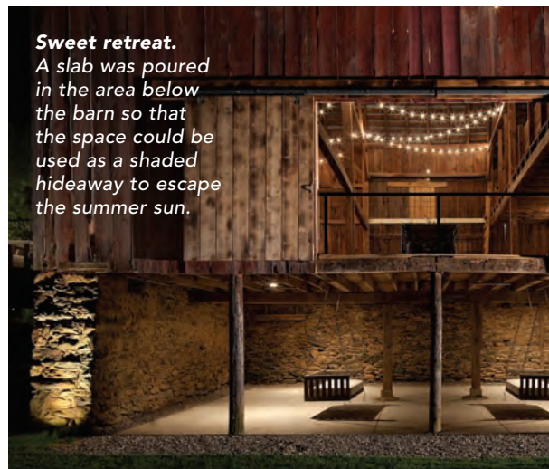
Sweet retreat. A slab was poured in the area below the barn so that the space could be used as a shaded hideaway to escape the summer sun.