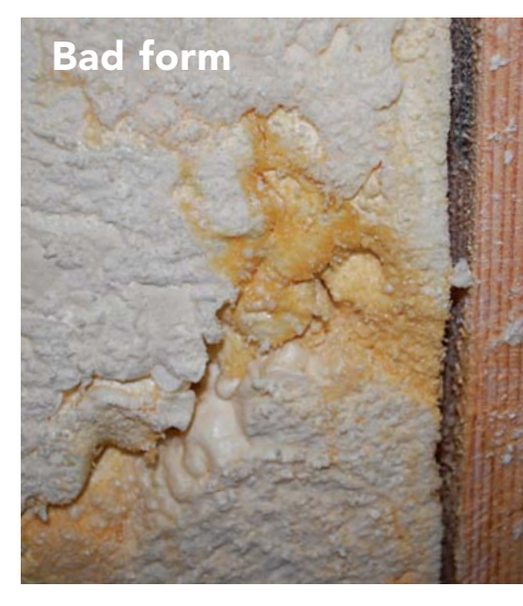
This B-rich foam didn't form correctly and has pulled away from the stud, providing a path for moist air to reach the sheathing.

COPYRIGHT 2016 by The Taunton Press, Inc. Copying and distribution of this article is not permitted.