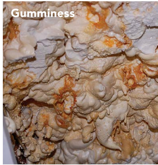
Gumminess is a typical sign of a B-rich mixture. If it looks like something a kid would want to eat (think caramel popcorn), then something has gone wrong.

In most cases, SPFI is a problem-free insulation that's nontoxic once cured. However, poor installation can lead to problems, some of which are obvious.