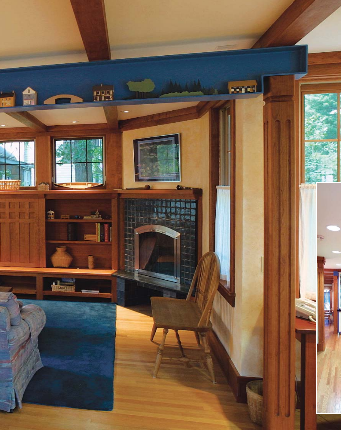
Arts and Crafts with attitude. Opposite the kitchen, freestanding wood posts and a colored steel beam frame the family room. In the photo below, the muntin pattern in the front windows is reflected in the balusters as well as the china cabinet. The elevator is to the right of the china cabinet. Photo left taken at D and inset photo taken at E on floor plan.