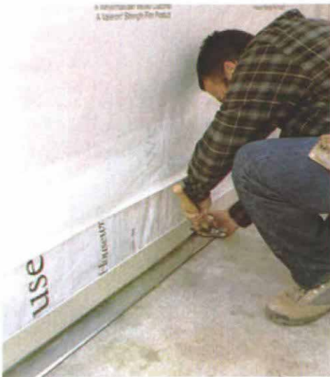
Bumping out the bottom. To get the siding started at the proper angle, a spacer should be installed behind the bottom edge of the bottom plank. A strip ripped from a plank (photo left) or galvanized Z-metal (photo center) can be used as a spacer.