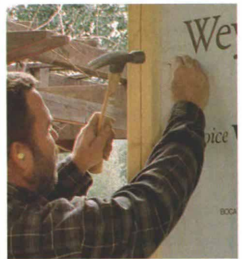
Guide nails speed installation. Course widths are measured up and marked from the top edge of the bottom plank. A temporary nail is driven at each mark as a guide.