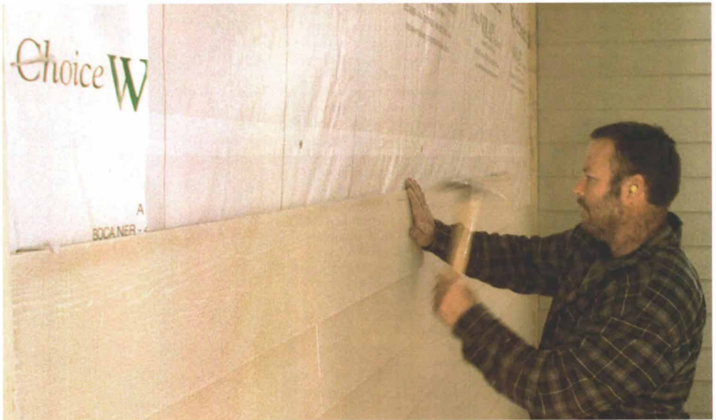
Nails are driven at the studs. Vertical lines are drawn on the housewrap at every stud location. After guide nails are driven, each plank is pushed up to the guide nails, and a nail is driven through the top edge of the plank at each stud.

tween the end of the plank and any trim, as well as between butt ends of the planks on walls more than 12 ft. long. The gaps are then filled with caulk, which allows for a small amount of expansion and contraction in the planks. Leaving gaps also means that it's not absolutely necessary to make perfect cuts. I try not to be sloppy, but any slight inaccuracies in my cut are hidden by caulk.