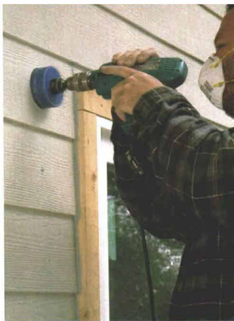
Hole saw is used for round holes.