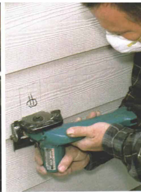
Plunge-cutting makes square holes.