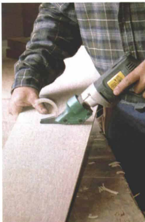
Electric hand shear means no dust.

Cutting siding made from sand and cement requires a few special tools. Most cutting can be done dust-free with an electric hand shear (photo top left). A shear can't cut into corners, so a jigsaw with a carbide blade finishes the cut (photo top right). A carbide hole saw can be used to cut in a round electrical box (photo bottom left), and a small circular saw with a carbide blade can be plunged in to cut for a square box (photo bottom right). A dust mask must be worn with the last three cutting choices.