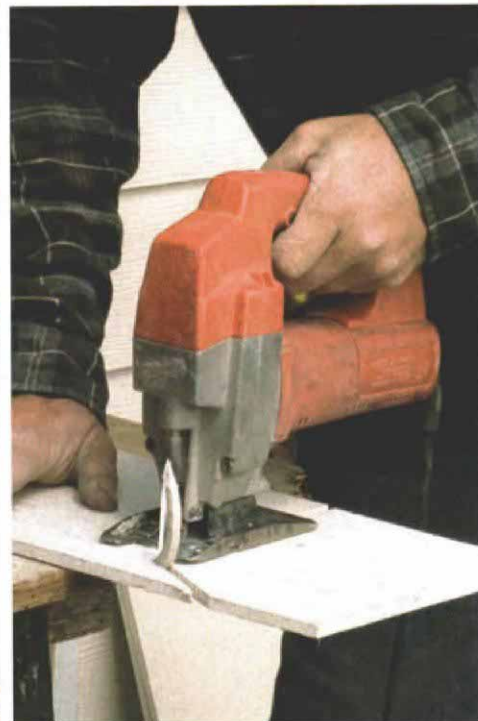
Jigsaw gets into corners.