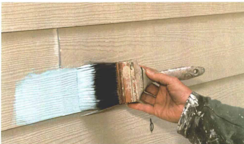
Caulk and paint make expansion gaps disappear. Gaps at plank ends and butt joints must be left for expansion in fiber-cement siding. These gaps are filled with latex caulk, and a coat of paint makes the seams disappear.

In a couple of places on this project, I had to use narrow strips of siding under windows. To avoid having large roofing-nail heads showing on these strips, I ran a bead of construction adhesive along the backs of the strips and then tacked them in place with a pneumatic brad gun. The brads held the strips until the glue cured, and their tiny heads disappeared beneath the surface. □