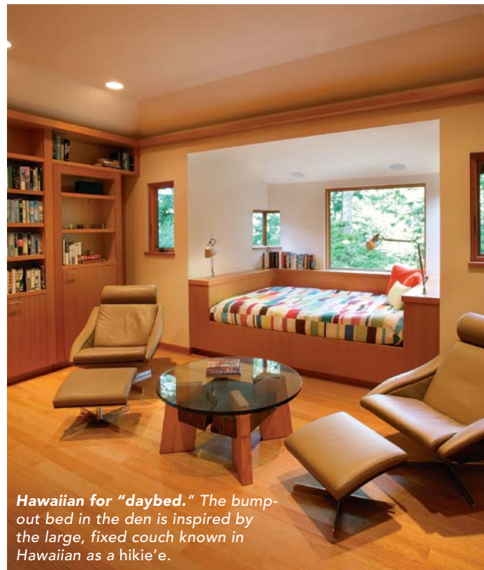
Hawaiian for "daybed." The bump-out bed in the den is inspired by the large, fixed couch known in Hawaiian as a hikie'e.

A warm welcome. The entry is celebrated with warm wood tones in the doors, cabinetry, and hallway ceilings. A live-edge bench hewn from Douglas fir reflects the natural surroundings and offers a place to sit. One-of-a-kind rolling-door hardware delights the craftsman in all of us.