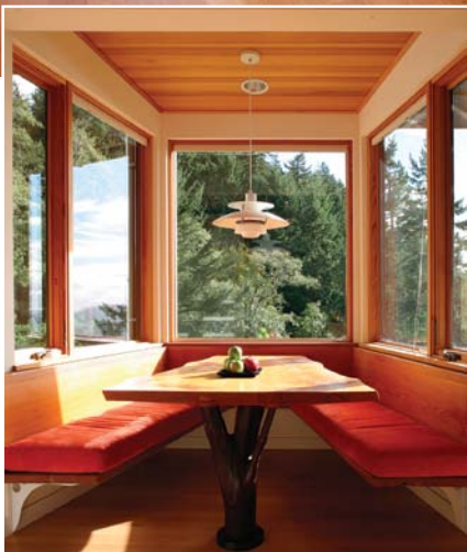
Dinner in the forest. The large windows wrapping three sides of the breakfast nook and dining bump-out (top) bring the surrounding scenery to the table.

go any farther than the entry to get the essence of what makes this home special.