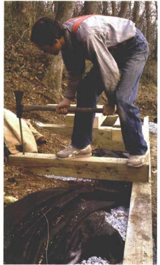
6. A maul drives the \frac{3}{8} -in. by 24-in. rebar that pins the tiebacks to the bank. Rebar is cut to length using an abrasive wheel in a circular saw. Notice that the tieback's front edge is set back from the first timber's face, beginning the wall's batter.