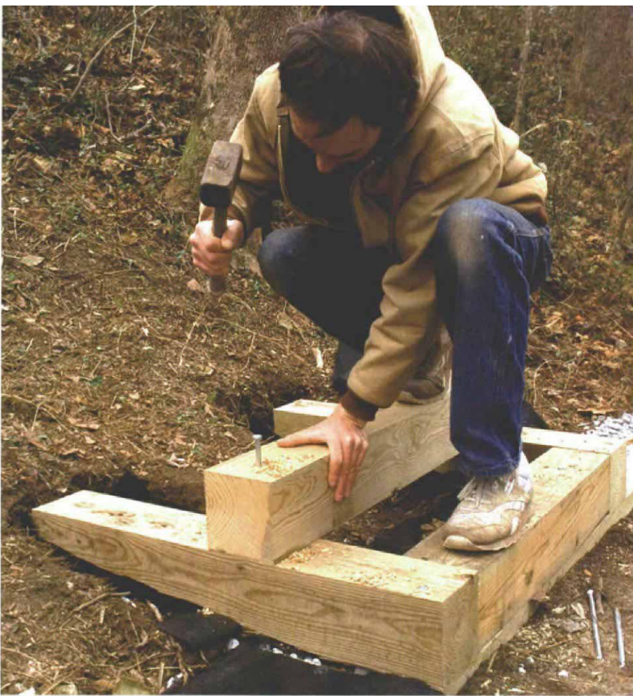
5. Galvanized spikes join riser to stringer. These \frac{3}{8} -in. by 12-in. spikes call for predrilling and a heavy hammer. Because the preservative salts in the timbers corrode steel, it's best to use galvanized spikes.