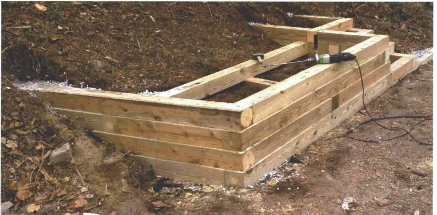
7. Cross tie connects sidewalls and tieback. Finishing the wall is now a commonsense matter of cutting, stacking and spiking timbers together log-cabin style. Fill behind the wall, alternating lifts of soil behind the filter fabric and 1 ft. of gravel between the wall and the fabric. Fill stairs with gravel.