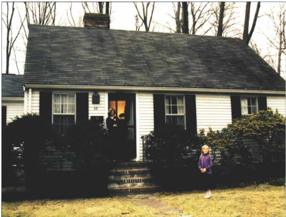
A small, unsheltered entry doesn't extend a warm welcome. Half hidden by shrubbery, the Cape's old front door had narrow stairs and was difficult to use. A new covered vestibule and stairs (above) create an inviting, more hospitable entry.