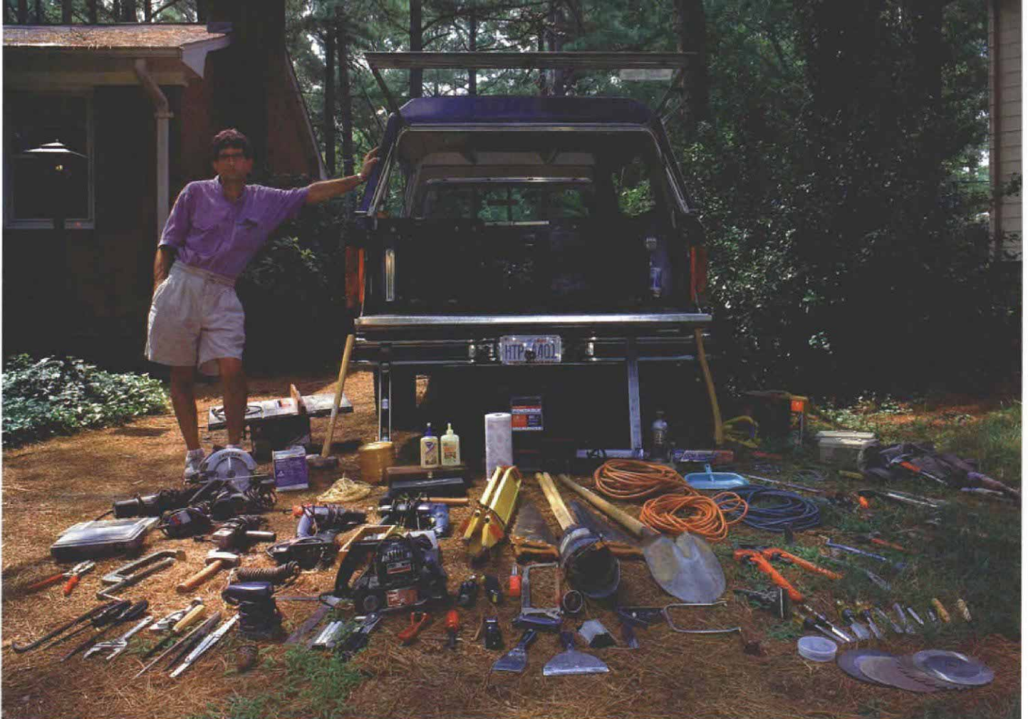
All this and more. Pictured here are only some of the tools and equipment the author can carry in the storage system he designed for his truck.