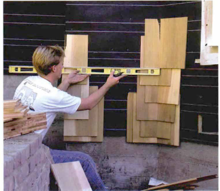
After the corners are built, fill in the field. A level can be used to mark the layout when the distance between corners is short; otherwise, a chalkline works well.