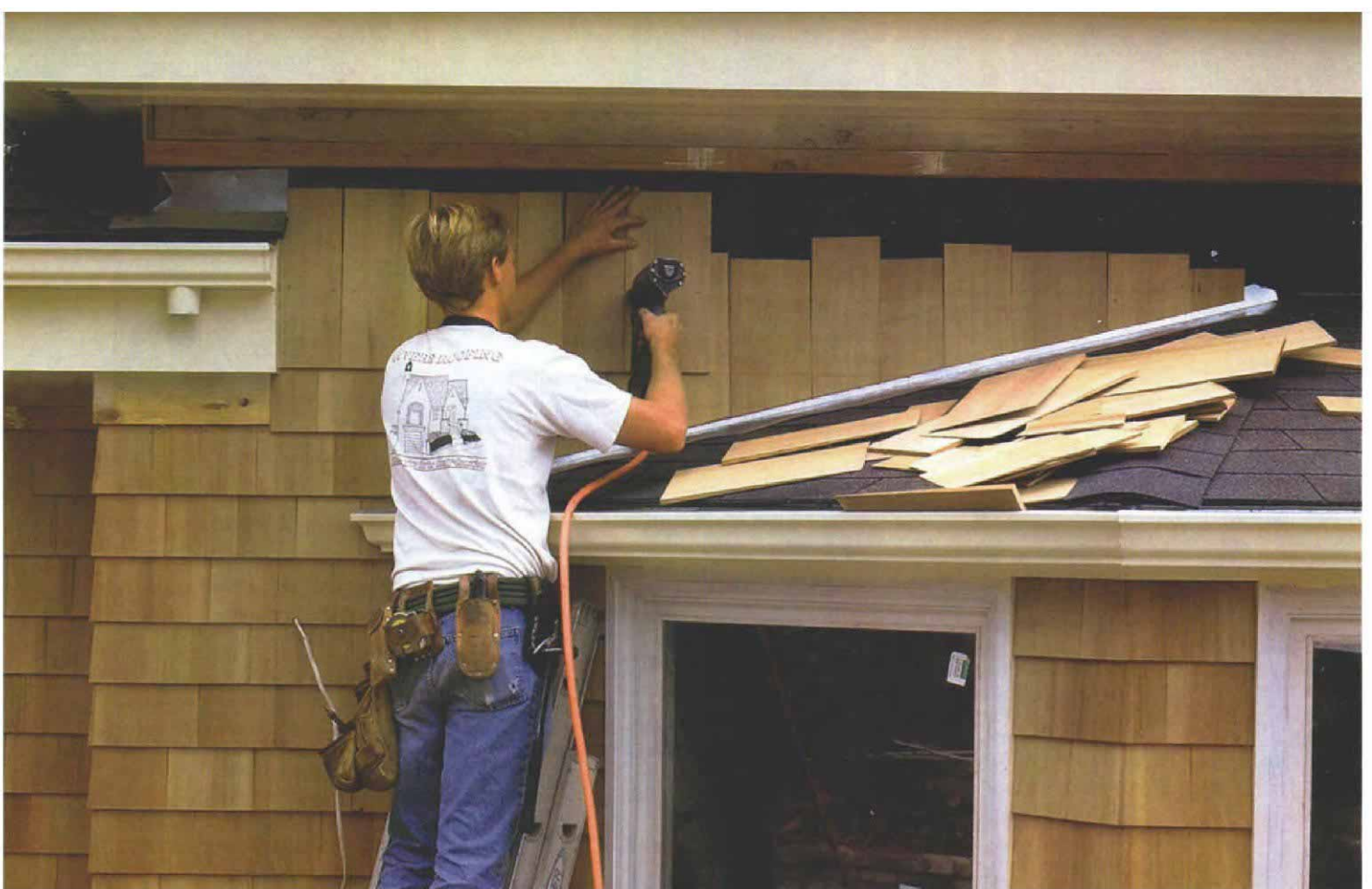
Shingling up a slope. When shingling a dormer or around a bay-window roof, the author precuts a number of shingles to the same pitch as the roof slope, but in a variety of lengths. These shingles can then be used to maintain the proper built-up thickness for succeeding courses.

doors? I've found that it is usually best to split the difference and run a slightly out-of-level course to minimize the height discrepancy of the course of shingles.