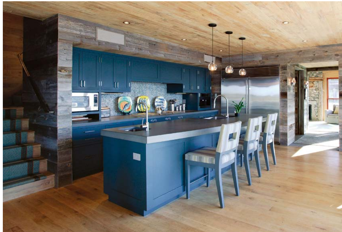
Custom yet classic. The bulk of the kitchen is nestled into a nook toward the north side of the house. Bluestone countertops sit on cabinets painted in Benjamin Moore Navy Masterpiece blue. Using colors reflected in the landscape helps ensure timeless interiors.

ing what seem to be endless views to the southern horizon. A 17-ft.-wide door made of mahogany and glass contains an 8½-ft.-wide lift-and-slide leaf that opens the dining and living space to the wraparound deck.