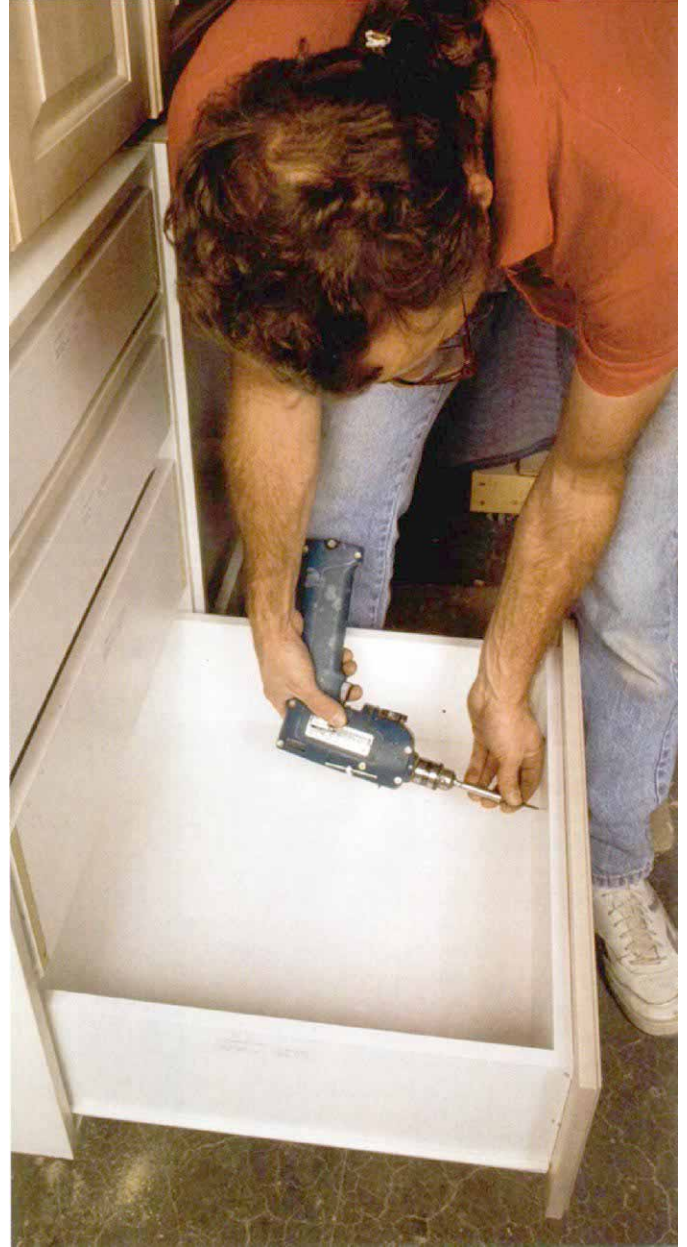
Affixing the drawer front. The adjustable inserts allow the drawer front to be moved \frac{1}{8} in. in each direction. When alignment is right, drywall screws make the positioning permanent.

hold the work 1 in. below the bit and set the depth stop to drill to a depth of \frac{1}{2} in. + \frac{1}{32} in. That give us a little allowance if we have thin stock or dust in the hole.