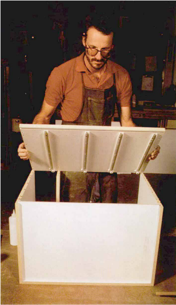
Building a box. Hardware installed, the box is ready to assemble. Here, the last side is aligned with dowels in the top, the bottom and the drawer divider. The back panel will tuck into the dado in the cabinet side.