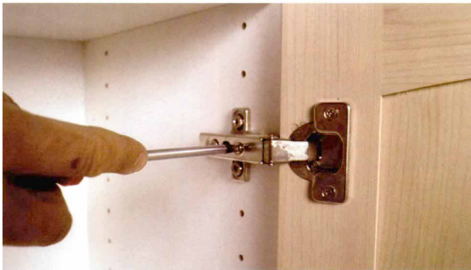
Hinges are adjustable. Slots in the hinge-mounting plates allow the hinge to be moved in and out, and up and down, which makes it easy to get the door to lay flat, square and centered on the cabinet.