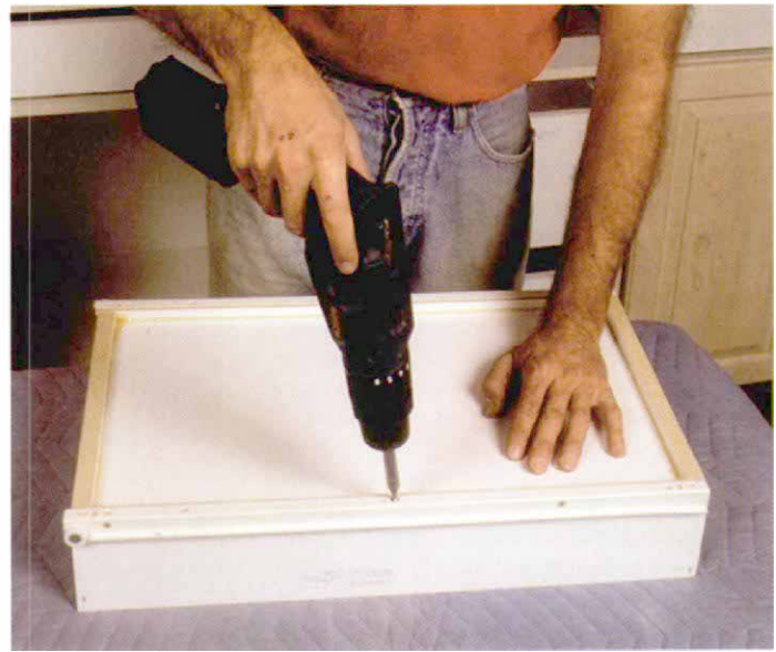
Drawers are just small cabinets. Also made of laminate-covered particleboard, the drawer boxes have the same construction details as their cabinets. Here, a drawer slide is being affixed to the bottom of the drawer.

Ideally, the doors of the upper cabinets should line up with doors and drawers of the lower cabinets. In practice, however, this is tough to accomplish. Windows, sinks and other obstacles often derail the strictly aligned approach.