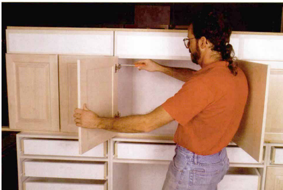
Installing the doors. Once the boxes are assembled, Fratrack snaps the doors onto their hinges and tinkers with their final positioning with a screwdriver. Sink bases make up the top tier of cabinets. They sit atop a row of base cabinets.