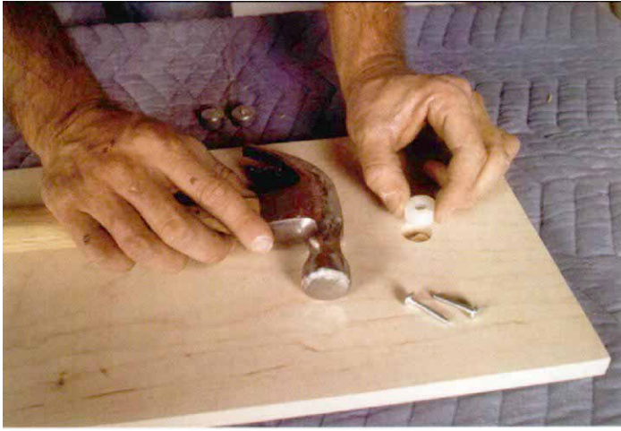
Fitting a drawer front. Drawer fronts in a European-style kitchen must be installed accurately. Two threaded, adjustable inserts are let into 20-mm holes in the back of a drawer front (above), which is then attached to the box with machine screws run into the inserts (below).