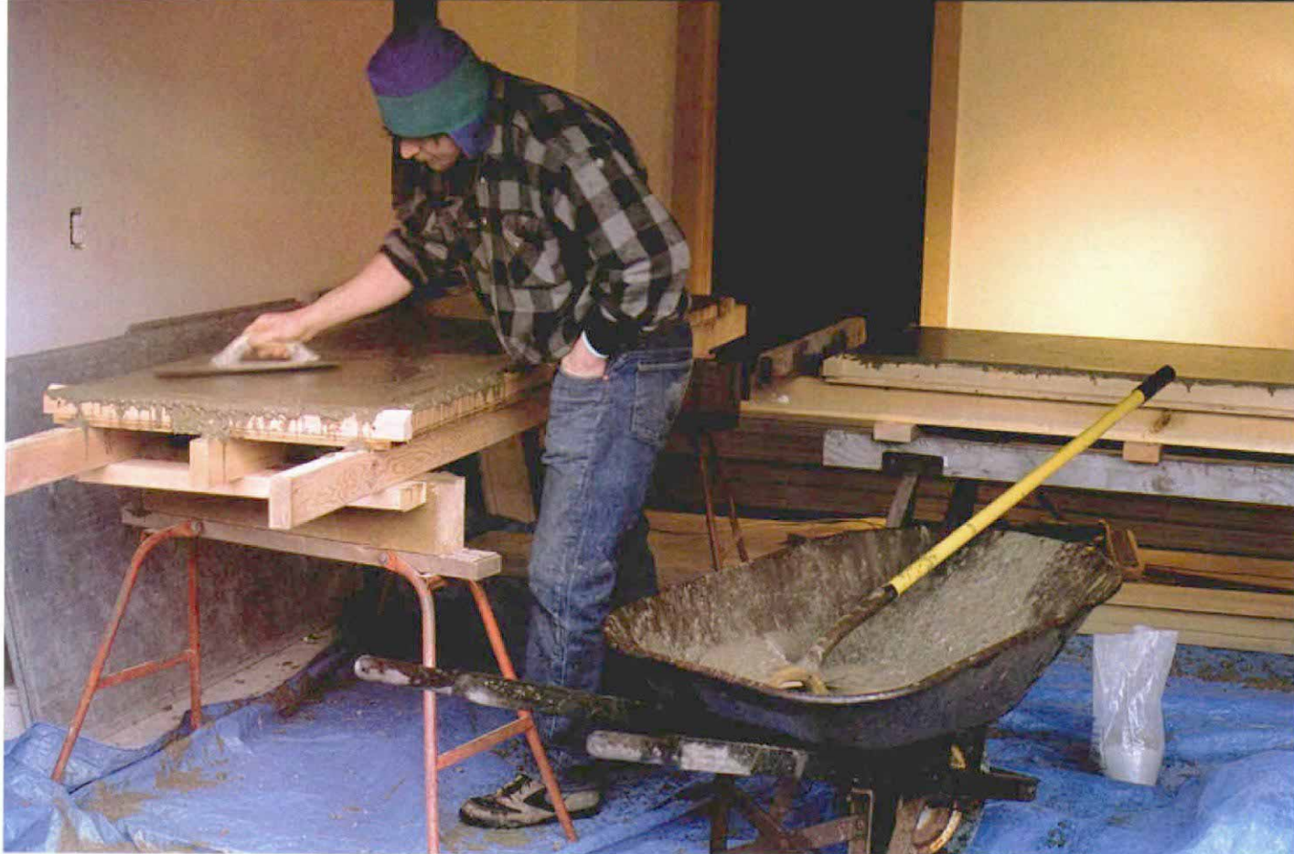
Steel trowel the work surface. After screeding the concrete into the forms and tooling the surface with a magnesium float, the author leans into the final finish of the countertop with a steel trowel. He then wrapped the counter sections in plastic and left them to cure for two weeks.

form. I beveled the blocks and sprayed them with WD40 for easy removal.