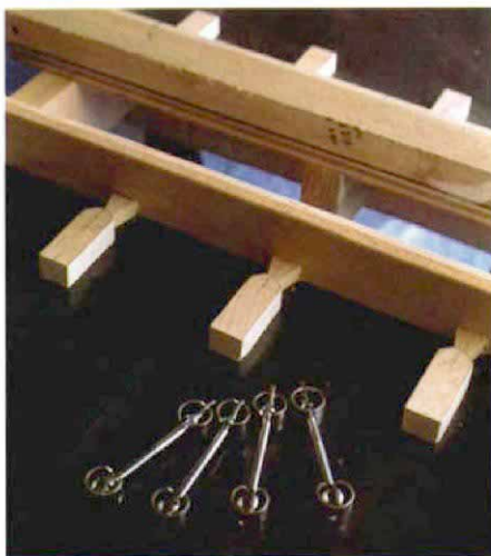
Joint connectors pull the parts together. A quartet of joint connectors was used to pull the two wings of the countertop together. The blocks glued to the form sides were removed after the pour, leaving slots for the connectors.

place, you eliminate the hassle of moving around a heavy, cumbersome slab of concrete. But there are problems with that approach. In addition to dealing with the mess that accompanies any concrete pour, a countertop has to be etched with muriatic acid and then thoroughly rinsed before its finish can be applied. I didn't want to introduce that wild card into the final stages of trimming out the Buckleys' house.