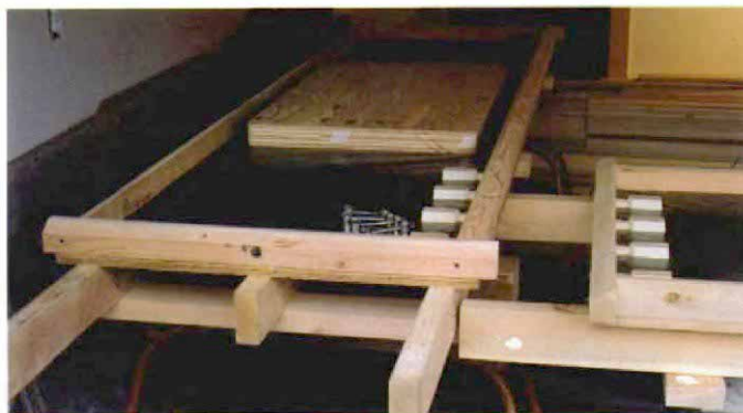
Put handles on the forms. Made of plastic-covered plywood and 2x4 sides, the forms were affixed to 2x4 handles for transport. In the background, the sink blockout is screwed to the form bottom.

A two-piece countertop —Where to pour? That's the dilemma facing anybody who's making a concrete countertop. If you cast the top in