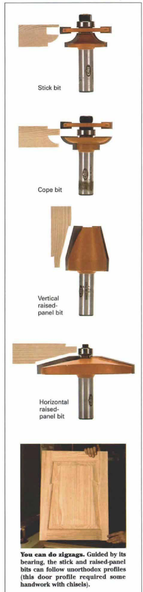
You can do zigzags. Guided by its bearing, the stick and raised-panel bits can follow unorthodox profiles (this door profile required some handwork with chisels).

But after trying them out in my shop and consulting with other carpenters and woodworkers who have used cope-and-stick router bits, I've found three good reasons to own these bits. First of all, if the lead time from a big shop is too long to fit the job schedule, building your own cabinet doors can make economic sense. Second, doors from big shops are reasonably priced only if they are standard shapes—rectangles primarily, with the occasional arched top. If you want to make doors with some complicated shapes in them (bottom photo, right), these bits are a good way to do it. And finally, if you enjoy making cabinets for the fun of it, a set of cope-and-stick router bits will definitely expand your capabilities.