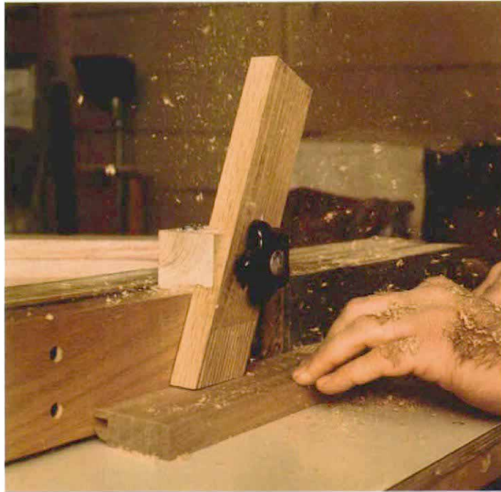
Cutting the stick. With the workpiece facedown on the router table, a rail is passed by the sticking bit. The rail is restrained from lifting by a feather-board hold-down. The curved portion of the cut will be a decorative detail. The groove above it will accept the edge of the raised panel.

Preparing stock —Manufacturers of matched bits recommend that your material be thickness planed and jointed flat and square. But because all of the routing operations are indexed off