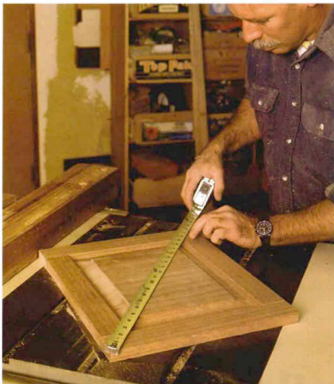
Checking for square. Before he glues up the door, the author checks the assembly for squareness by measuring the diagonals. When the diagonals are equal, the door is square.

The vertical bit (left photo, facing page) doesn't require a speed control or a large cutout in your router table. I used the vertical bit with my standard fence, which is 3¼ in. high. That's not quite high enough in my opinion. The cuts I got were a little bit wavy, although they could be