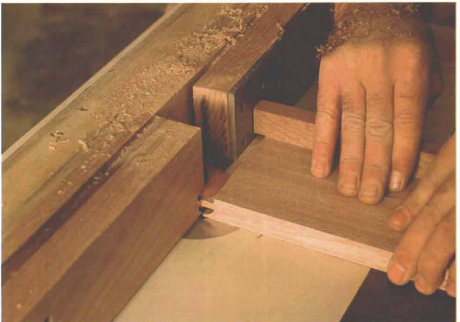
Cutting the cope. The ends of the rails are milled with a coping bit to mate with the profile of the stick cut. To keep the end grain from tearing out as the bit exits the work, the author places a backer piece behind the rail. The backer must have the cope profile milled into its edge to nest properly against the workpiece.