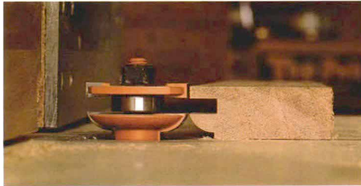
Adjusting the cope bit. Fine-tune the height of the coping bit by placing a piece of the stuck rail facedown next to it. The gap in the bit should correspond to the gap in the rail.