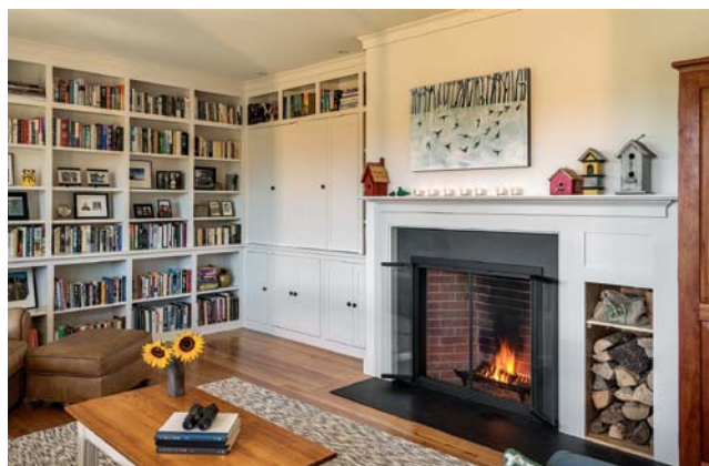
Traditional touch. In the living room, the modified Rumford fireplace is taller and more efficient than a typical fireplace. The built-in firewood box offers a historic reference to a traditional New England beehive oven, but with more functionality.