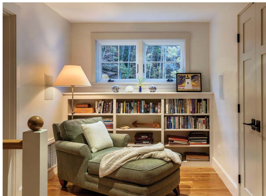
Smooth landing. At the top of the stairs, a small landing becomes a private space for guests, who also use the upstairs bedrooms.