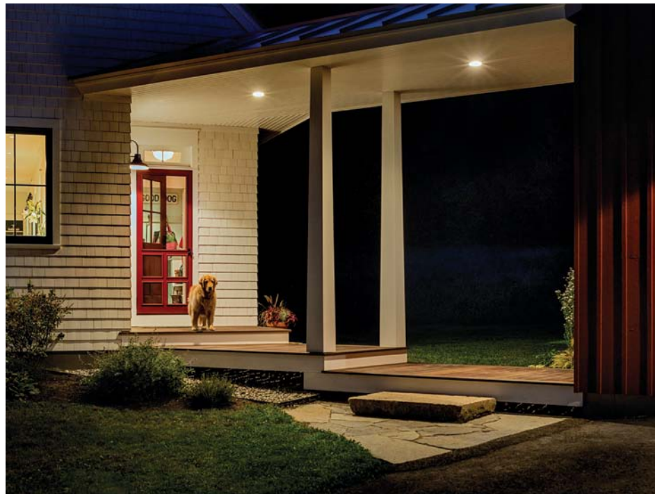
Covered connection. A sheltered walkway links the house's back entrance with the garage, about 20 ft. away. LVLs held up by tapered columns support the roof.

foam is derived from petrochemicals, but we decided that its ability to lower the home's energy demand balanced out the environmental penalty involved in its manufacture.) The outside of the foundation and the underside of the basement slab are insulated with 2 in. of rigid foam (R-10). Our last blower-door test put airtightness at 0.36 ACH50, thanks to carefully detailed wall and roof assemblies, taped sheathing, spray foam, and a meticulous framing crew. Tight houses need a source of fresh air, so Steve chose a heat-recovery ventilation system that exhausts from the bathroom and kitchen area, with supplies to the first-floor bedroom and living spaces.