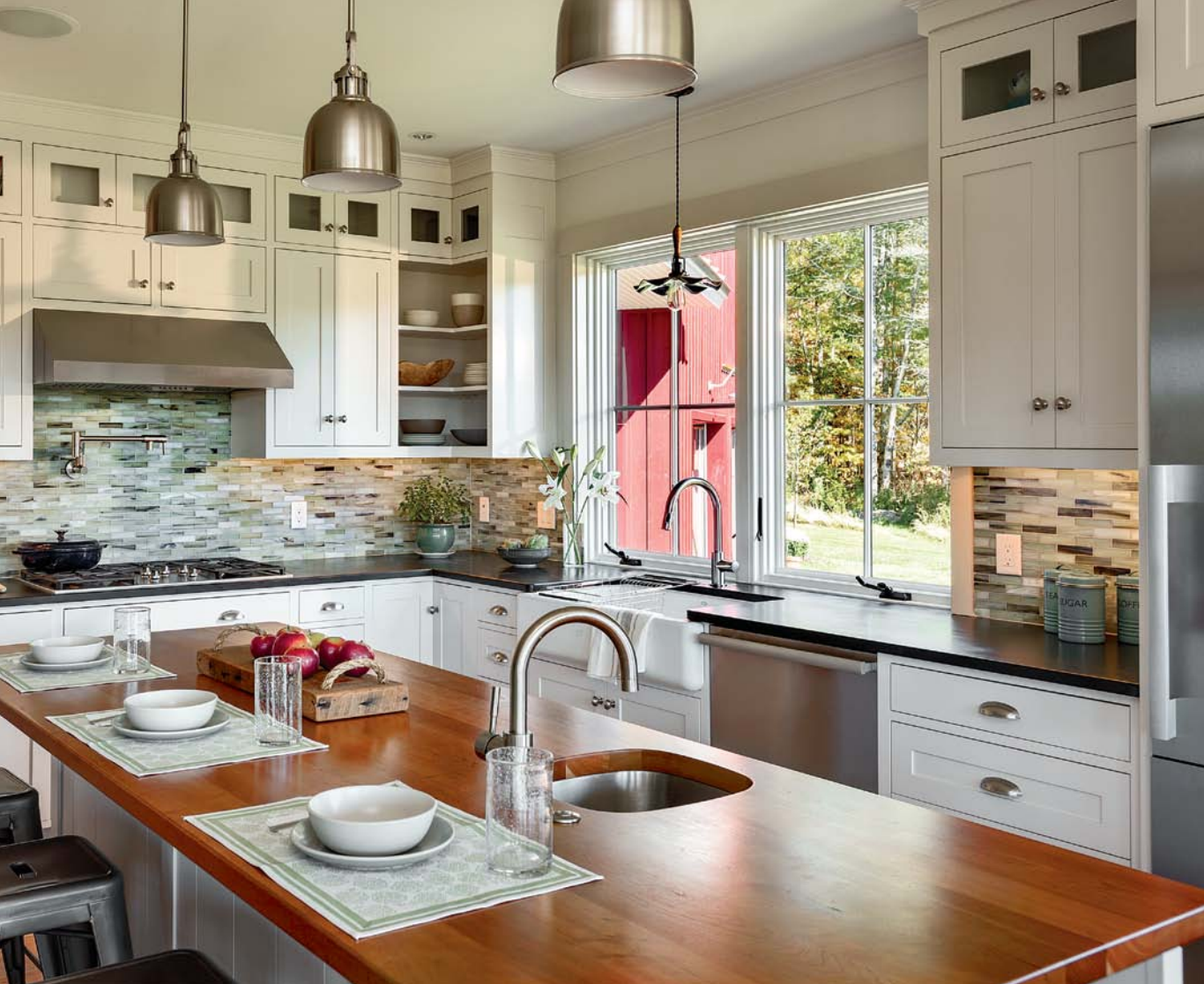
Arriving at home. The mudroom entrance, used by family and friends alike, leads into the kitchen, which is also positioned with a view toward the driveway.